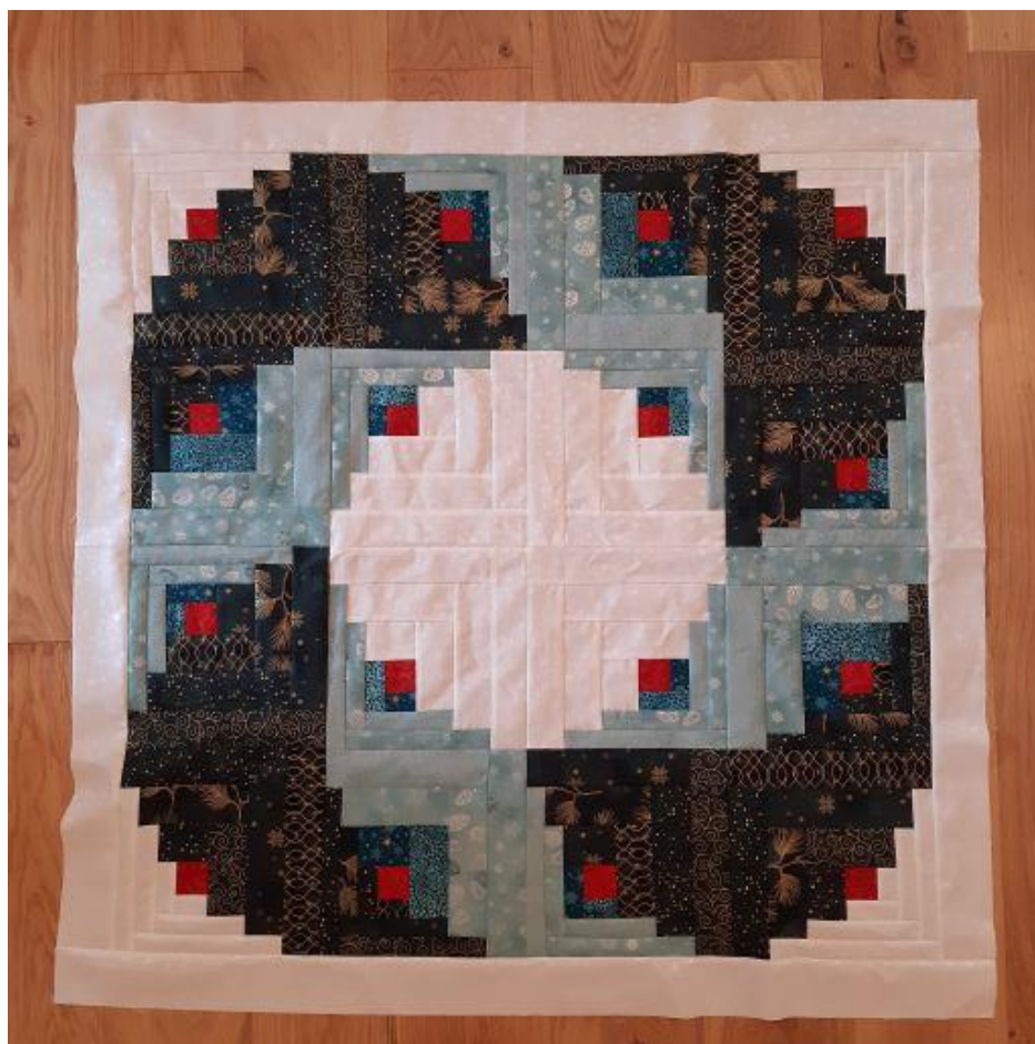
Approx. finished size: 36" by 36" By Valerie Nesbitt