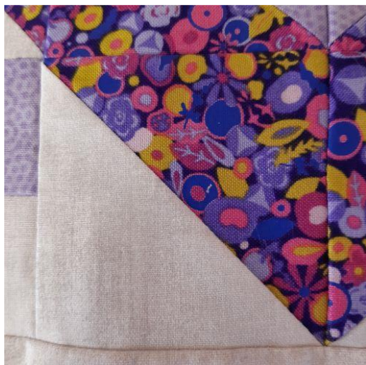
Outer blocks Background and pattern

HALF SQUARE TRIANGLE UNITS: using 2.5" finished paper Thangles method: