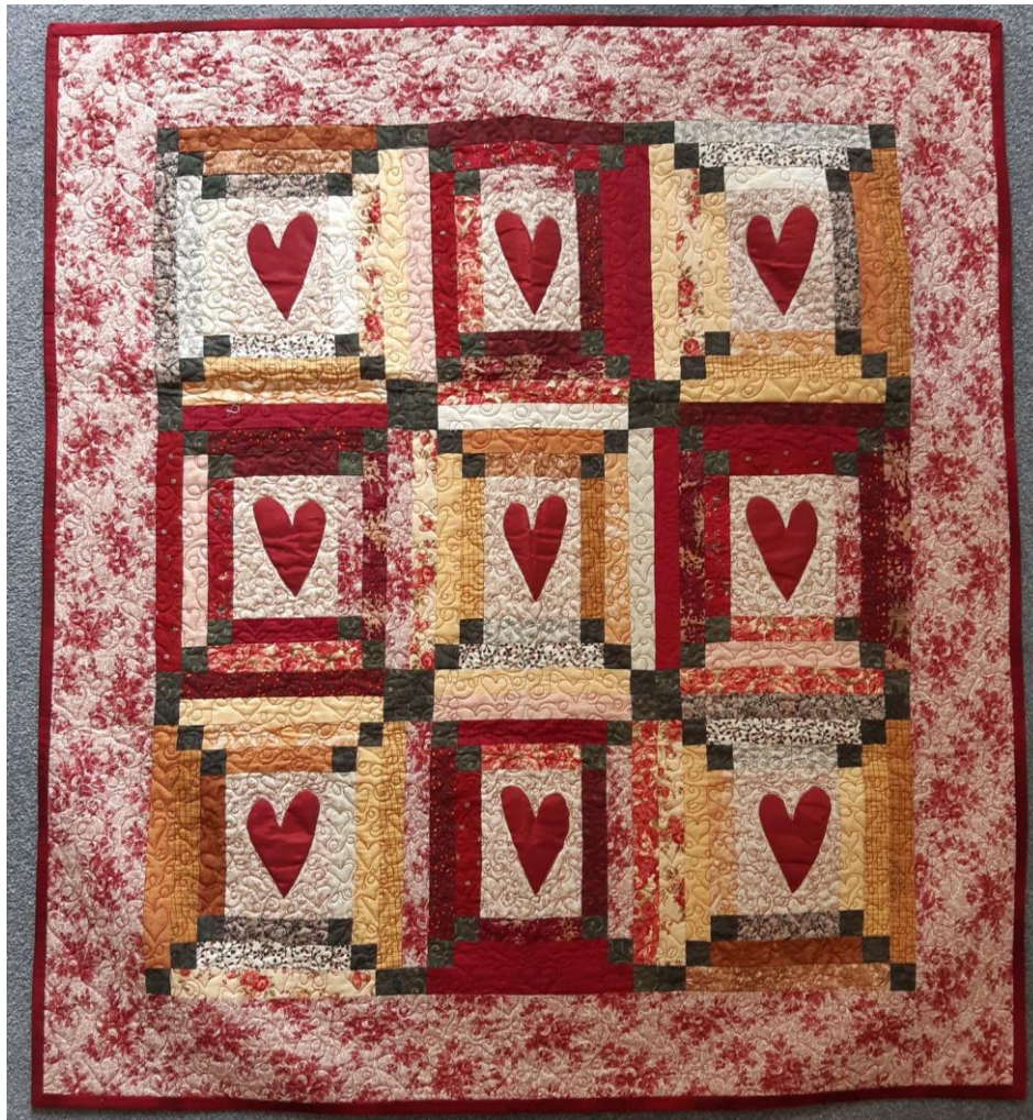
Approx. finished size: 38" by 44" By Valerie Nesbitt