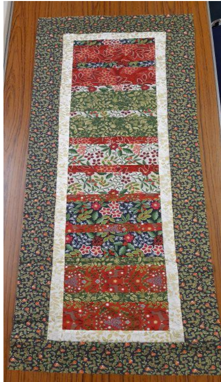
By Valerie Nesbitt Approx. finished size: 18" by 46"