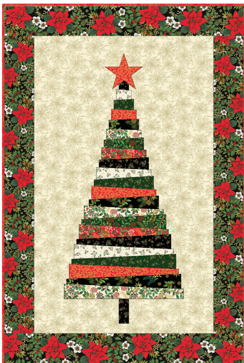
Deck The Halls